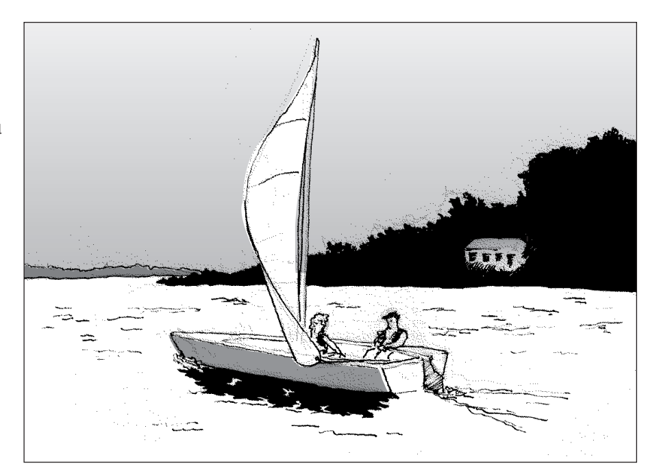
Help protect your local waterways and the Chesapeake Bay. Proper yard care practices can give you a beautiful yard and help protect the Bay!

Emissions from burned fossil fuels deposit pollutants directly on the waters of the Chesapeake Bay, and on the land where they can be washed into streams. Actions taken at home to reduce energy demand can help