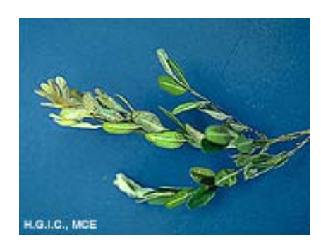
Volutella stem blight

Control: Diseased branches should be pruned out and when the foliage is dry, plants should be thinned to improve air circulation and light penetration. Old fallen leaves and diseased leaves that have accumulated in the crotches of branches in the interior of the plant should be shaken out and removed. Properly timed applications of copper fungicides or lime sulfur applications can be used in severe infections. Sprays will not cure diseased branches. Spray applications should start just before new growth begins in the spring and continue until new growth is completed. Additional sprays may be needed in the fall to protect late summer growth during rainy seasons. Adequate spray cov-