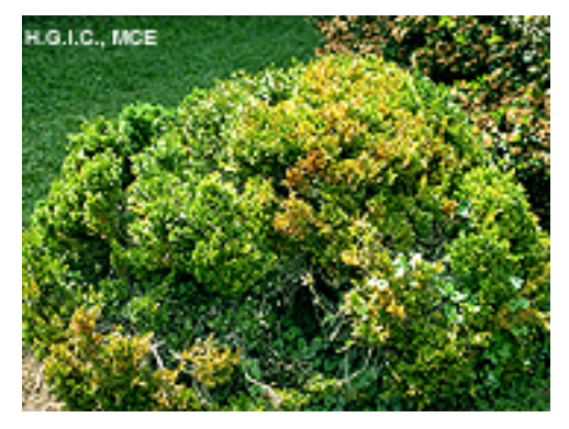
Winter damage on Boxwood

Prevention: Winter damage can be reduced by locating plants