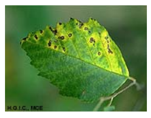
Leafspot on birch

Leaf spots on birch can be caused by several different fungi. The fungi Septoria and Cylindrosporium produce small spots without definite borders. Colletotrichum causes larger brown