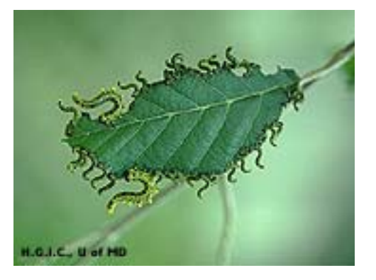
Dusky Birch Sawfly Croesus latitarsus

Yellowish-green larvae, resembling caterpillars may be seen feeding along the edges of leaves. Branches may be stripped of foliage and small trees may be defoliated. The dusky birch sawfly