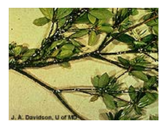
Azalea Bark Scale Eriococcus azalea

A scale infestation is indicated by sooty mold on leaves, yellowing of leaves, and twig dieback. This scale is most obvious from