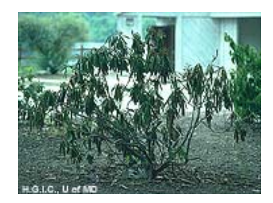
Phytophthora Root Rot and Dieback

Phytophthora dieback, although uncommon in the landscape, is a distinct phase of the Phytophthora disease syndrome on rhododendrons. It can be brought into the landscape on infected plants and can be severe on plants grown under overhead sprinkler irrigation. The disease occurs when the pathogen is splashed onto the foliage. Thus, infected plants may show symptoms on leaves and shoots, but may have healthy root systems. Plants with dieback develop symptoms on the current season growth. Mature leaves are often resistant, however if they become infected, they usually fall prematurely. Infected leaves show chocolate brown lesions that often expand and cause dieback of the shoot tips. Infected leaves droop and curl towards the stem. Diseased leaves remain attached to the stem. Growth of the pathogen through the midrib tissue often produces a V shaped lesion that extends along the leaf midrib into the stem